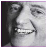
Michael Mansfield QC: Civil Rights Lawyer & Author

Invited Speakers: John Denham: Secretary of State