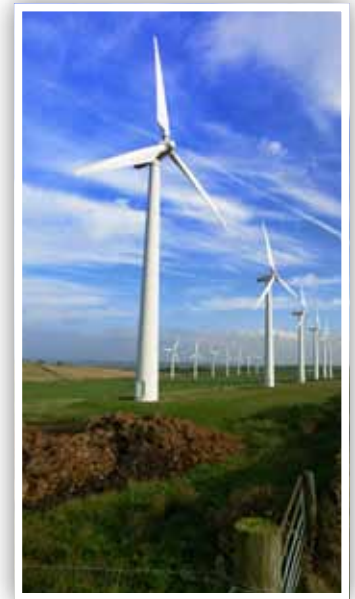
Are there opportunities for jobs because of climate change?