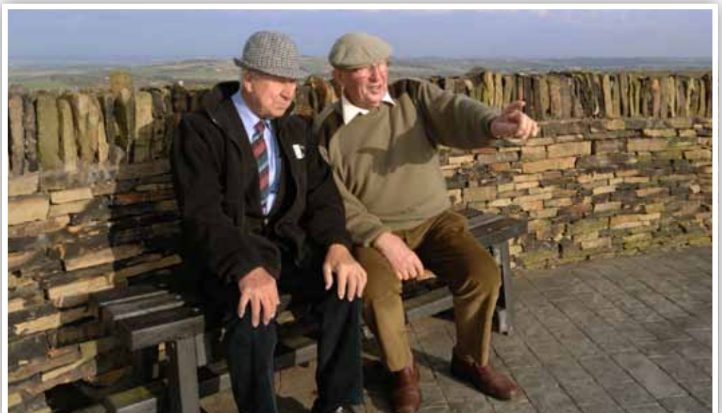
Rural communities can be hidden and overlooked